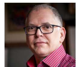
Jim Obergefell Supreme Court Marriage Equality Plaintiff