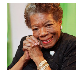
Maya Angelou Poet, Writer & Memoirist