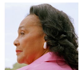
Coretta Scott-King Civil Rights Activist