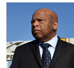
Rep. John Lewis Congressman + Activist